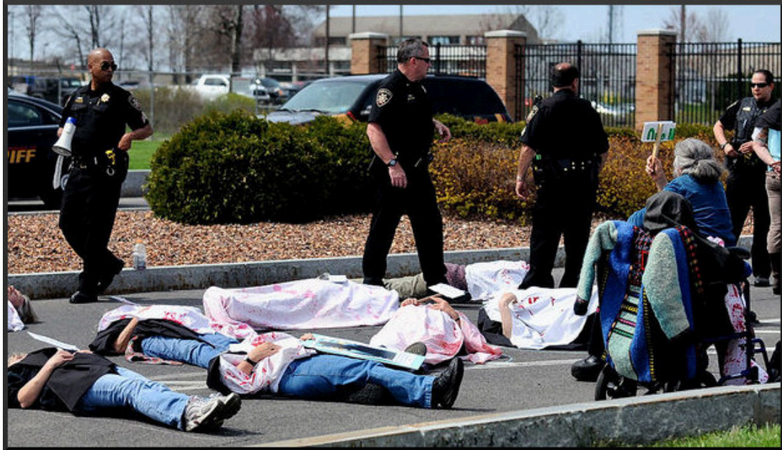
Upstate Drone Action Die in at Hancock Air National Guard Base

The installation of a drone overlooking people in Manhattan can bring them into the larger discussion.