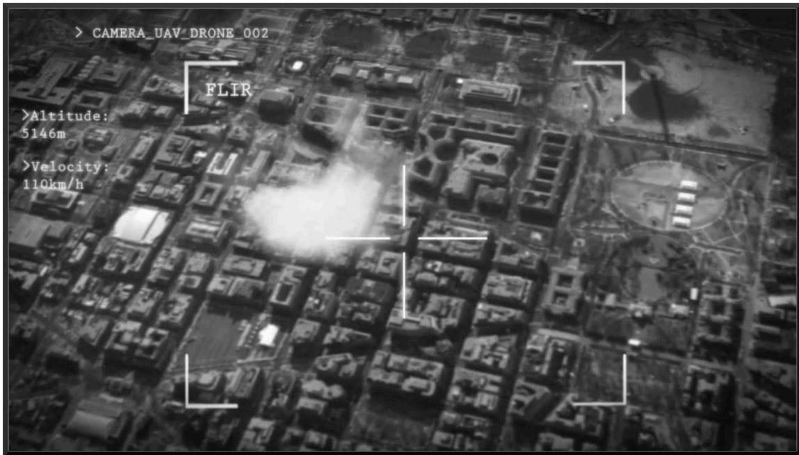
Image from a reaper drone during operation