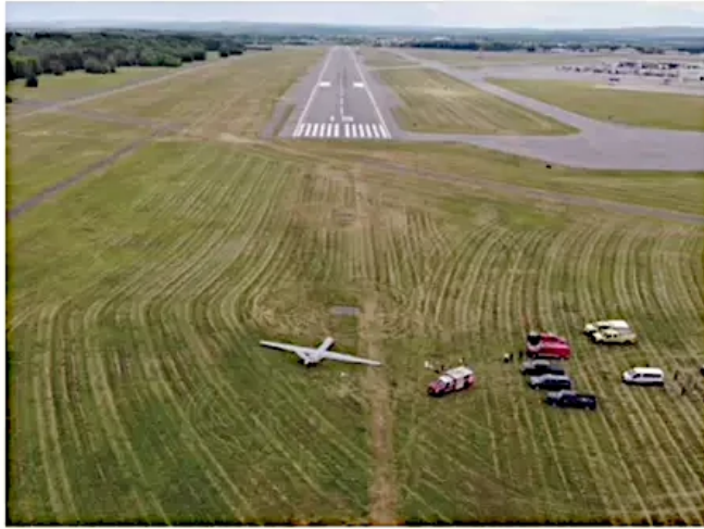
An MQ-9 Reaper drone operated by the NY Air National Guard's 174th Attack Wing is shown after crashing June 25, 2020 at Syracuse Hancock International Airport.

Updated: Apr. 18, 2021, 7:30 a.m. | Published: Apr. 18, 2021, 7:30 a.m.