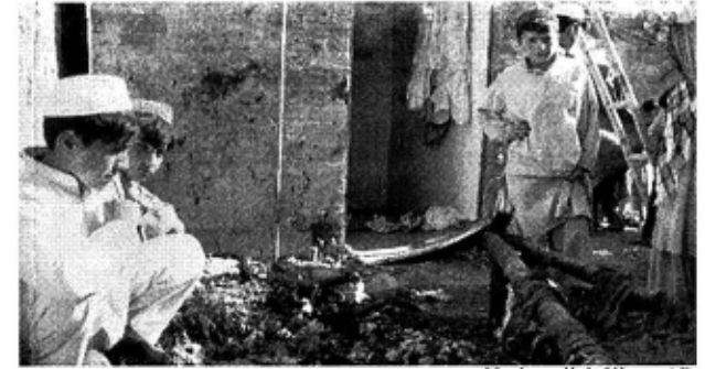
Pakistani children gather near a bloodstained wall after suspected U.S. drones struck a home in Mohammadkhel, Pakistan, last year.