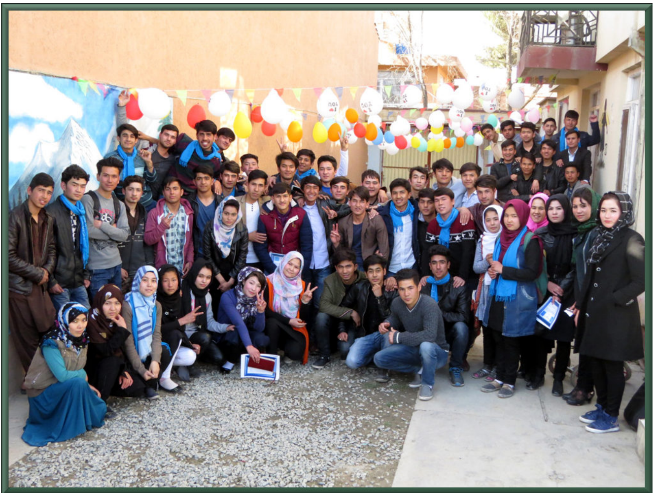
Afghan Peace Volunteers work for peace at their Border Free School in Kabul

Ten days before, in Charlottesville, Virginia, torch bearing white supremacists had marched in a “ Unite the Right ” rally to protest the planned removal of a statue of the Confederate General Robert E. Lee. Replete with flags of both the Confederacy and the Nazi Third Reich and traditional fascist chants of blood and soil, the rally met with resistance from anti-racist activists, one of whom was murdered and others injured when one of the united right used his car as a weapon of terror, driving it into the crowd. There was outrage when Trump responded by condemning the violence on all sides and declaring that there are very fine people on both sides of the issue.