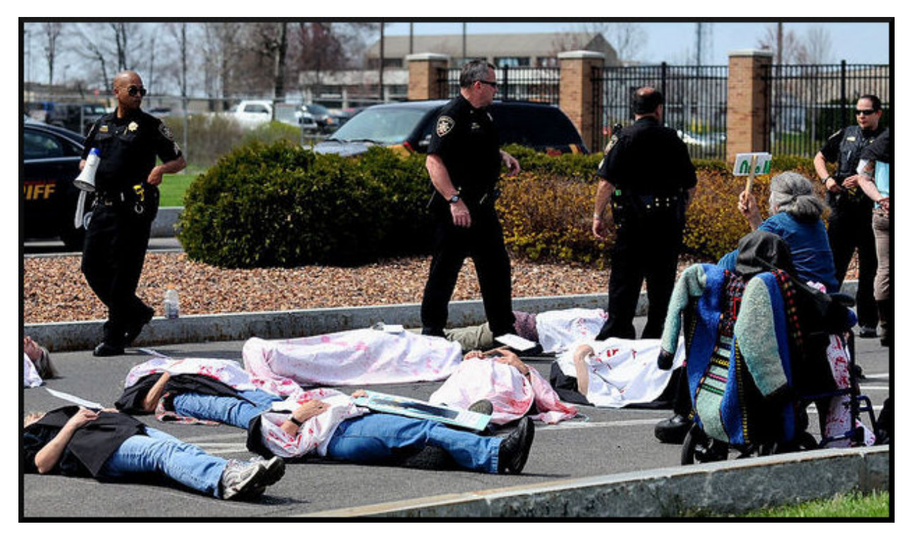
Die-in outside Hancock drone base in April 2013.

Lying on the floor, squeezed between the seats, I asked the two deputies to give me room to sit. The deputy in the passenger seat called out: "You'll be at the jail in just 15 minutes or so, live with it."