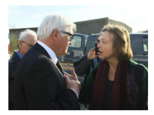
Activist Elsa Rassback and German Foreign Minister Steinmeier

German activists are engaged in drone resistance around US Ramstein base which houses a critical repeater that is necessary for drone strikes in West Asia and Africa. Ramstein has been a critical asset to US wars since the US occupation of West Germany after World War II. Now it's drone control. There are a number of things going on in German resistance at present.