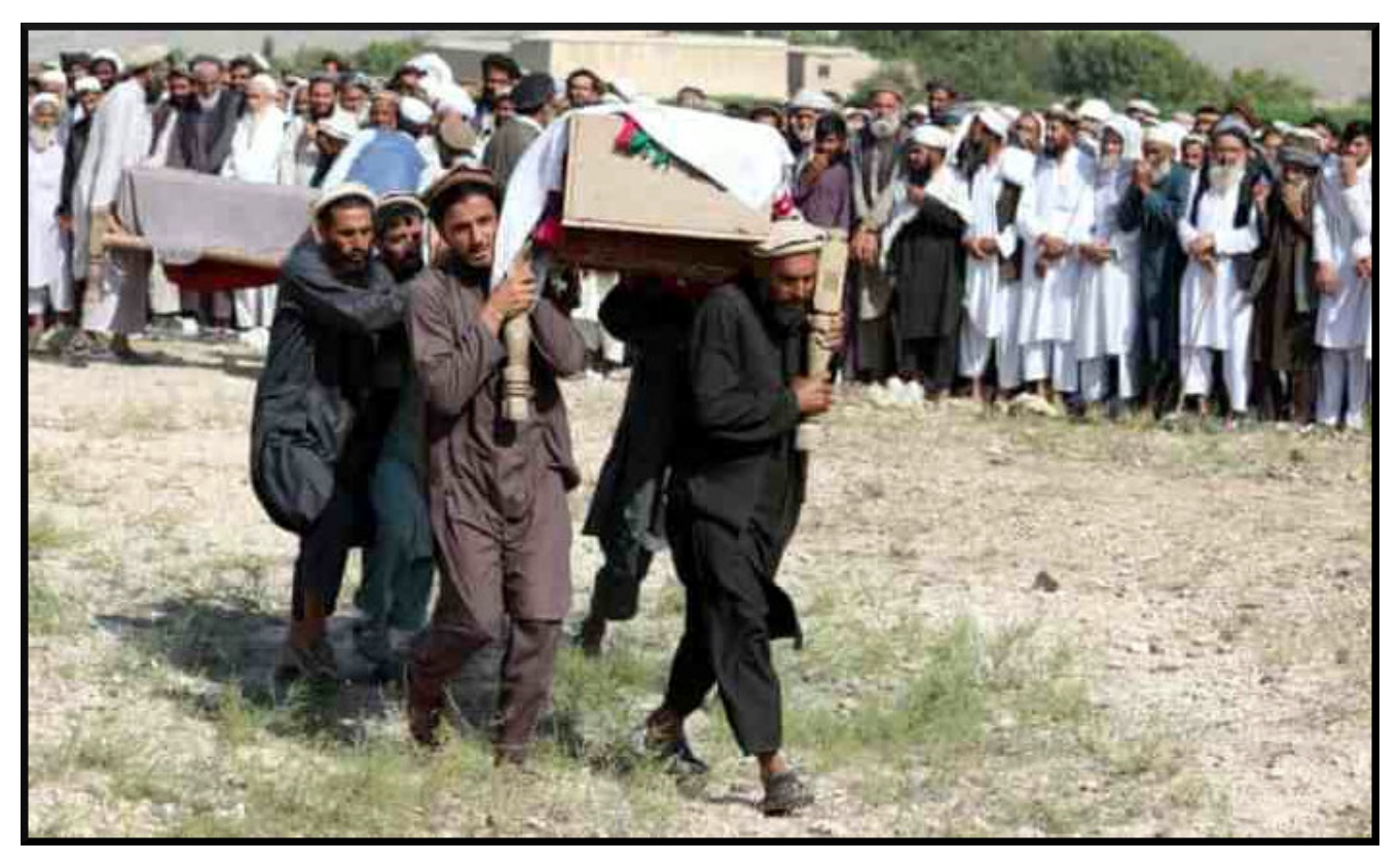
Funeral for pine-nut farmer killed in drone strike in Nangarhar Province in Afghanistan in September 2019.

Armed drones make bitter enemies around the world and create insecurity as they sow hate and vengeance.