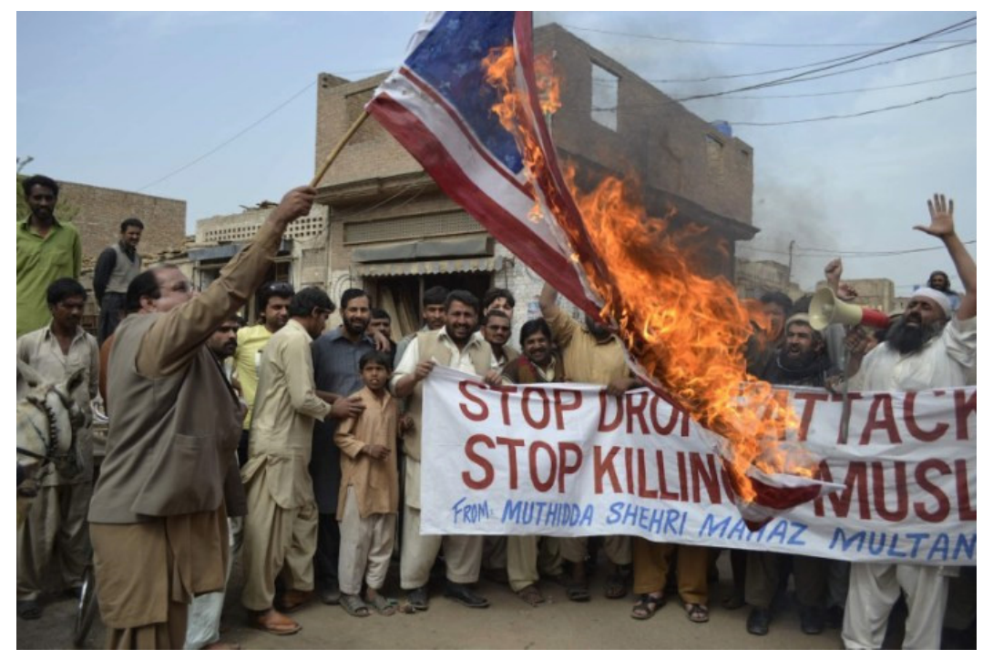
Protest against U.S. drone strikes after drone attack in Multan, Pakistan, in 2012.

Armed drones make bitter enemies around the world and create insecurity as they sow hate and vengeance.